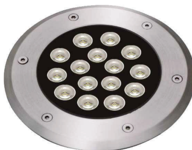
InGROUND - Round