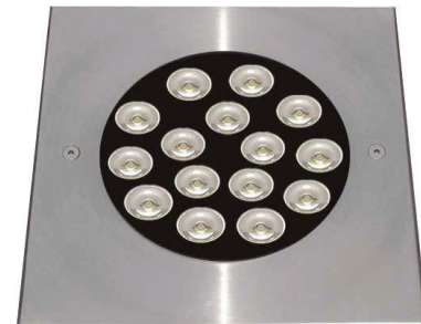
InGROUND - Square